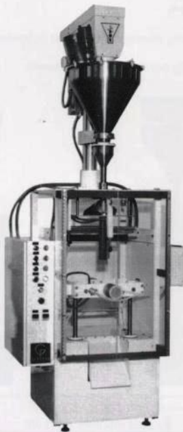
Model E1AC with Auger Filler