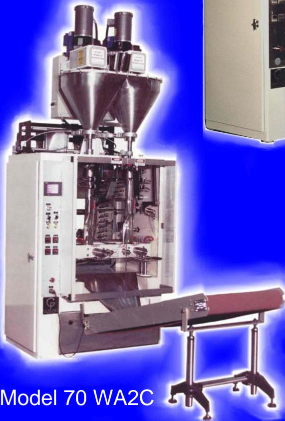
Model 70 WA2C