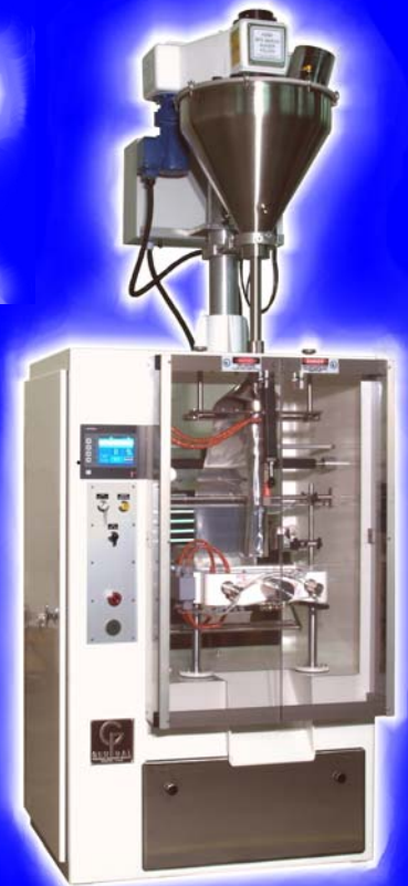
Model 70 AC